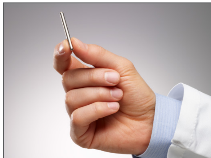
Figure 3: The ITCA 650 osmotic mini-pump containing exenatide.

In summary, numerous strategies with the potential to overcome barriers to effective treatment of T2DM have been approved or are currently under development. These include innovative treatment approaches using existing medicines, electronic tools to support patient adherence, and novel drug delivery methods.