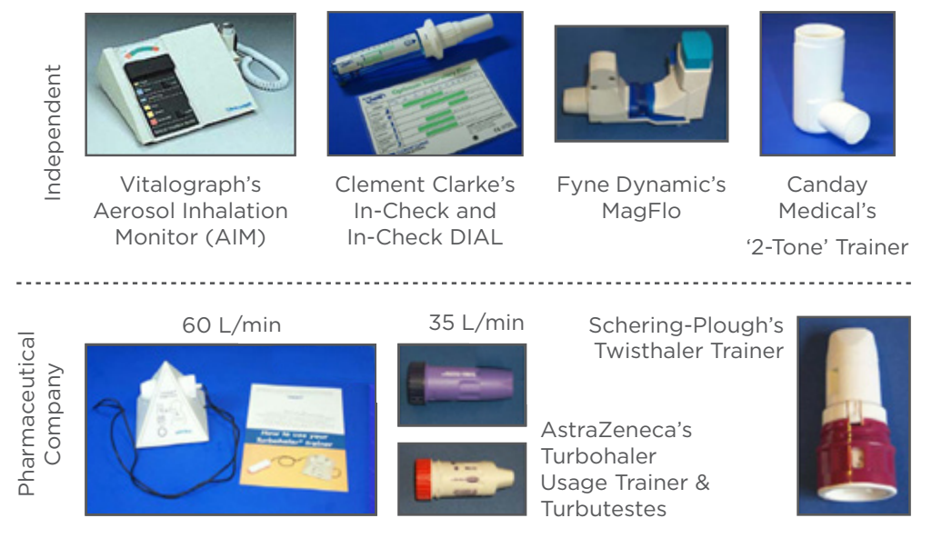
Figure 2: Non-commercial and commercial training tools for inhaler devices.<sup>33</sup>