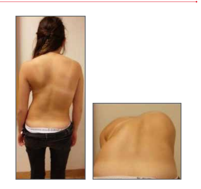
Figure 1: A structural right convex thoracic scoliosis. The lateral deviation is shown in the left image while the rotation of the spine is shown as a keel of a boat (gibbus) by bending forward in the right image.

Scoliosis has been a recognised condition for centuries. Structural scoliosis must be discriminated from functional scoliosis that may be caused by leg length discrepancy or back pain in a patient with disc herniation. A structural scoliosis is clinically suspected if it appears as a keel of a boat when examining the patient bending forward (Figure 1). The keel or gibbus is an expression of the rotation of the spine as structural scoliosis, and is of a three-dimensional (3D) deformity.