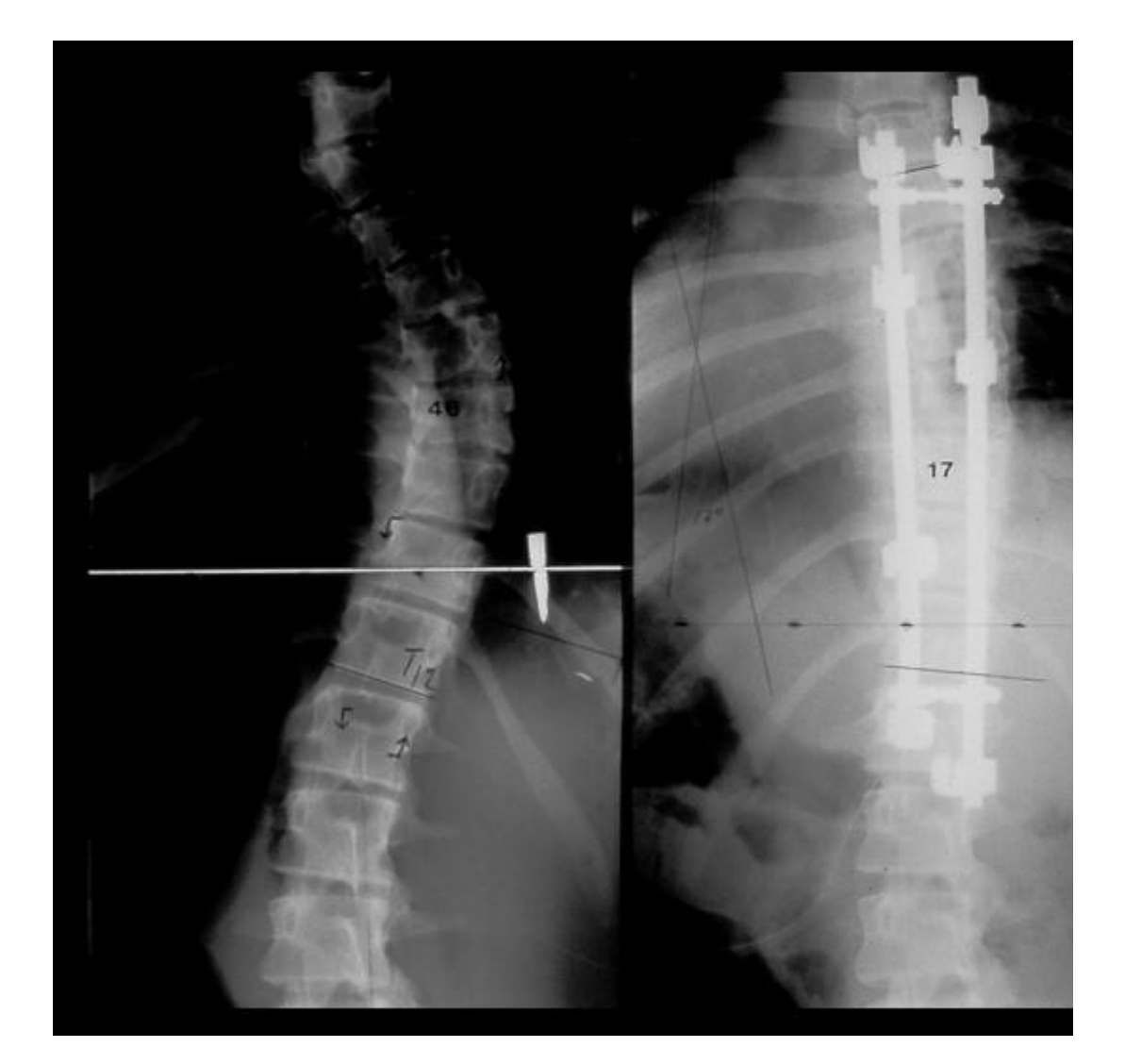
Figure 4: Radiographs that show idiopathic scoliosis in a girl aged 14 years before and after surgical treatment using Cotrel-Dubousset instrumentation.

and thereafter stays at home for another 10 days before the general condition is acceptable for attendance of regular school classes.