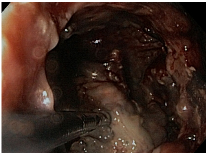
Figure 3. Internal endoscopic aspect of the cavity: removal of necrosis by use of a polyp grasper.