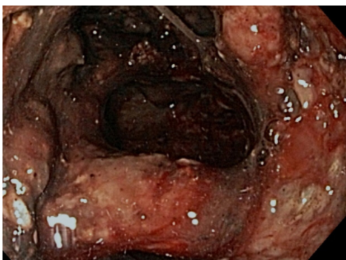
Figure 4. Internal endoscopic aspect of the cavity after removal of most of the necroses: vital splenic artery crossing the lumen.