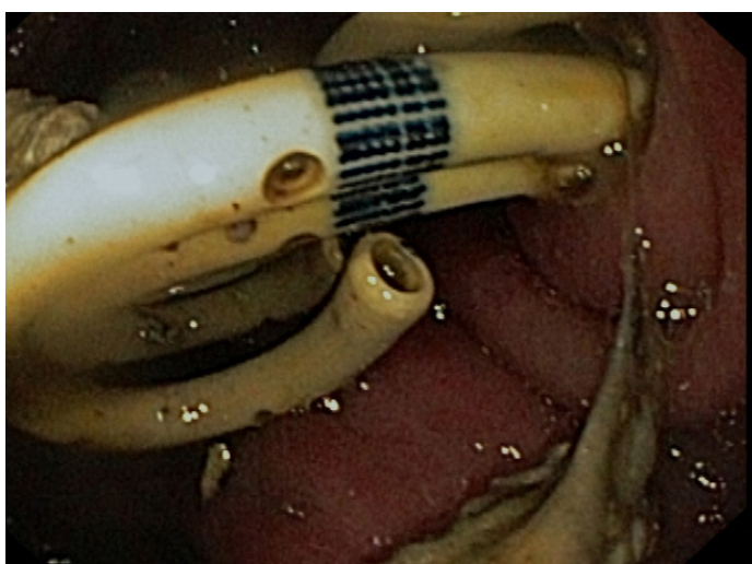
Figure 5. Endoscopic view of the gastric posterior wall: three double pigtail drainages left in place to keep the access open until a complete resolution of the cavity is achieved.

EUS-guided needle puncture is followed by the introduction of a guide wire under fluoroscopic co-control and dilation with a plethora of instruments (Soehendra-retriever, bougies, and dilation balloons, see Figure 2 ). The resulting channel is maintained by drainages or stents to offer time for subsequent consolidation before proceeding to necrosectomy. In most patients, a maximum diameter of 18 to 20 mm can be achieved during the first procedure. Broad access usually results in rapid general improvement and easier manoeuvring during the following interventions.