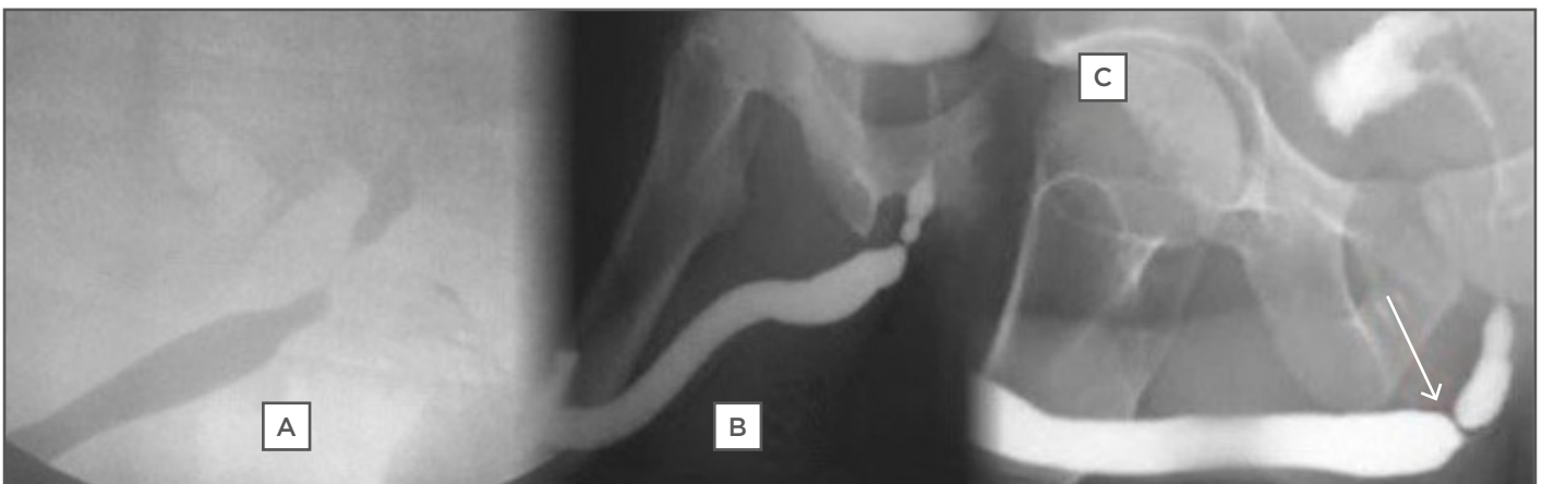
Figure 1: Retrograde urethrography images: A) dynamic; B) static; C) static showing bulbar stricture.

Voiding cystourethrography (VCUG) provides information on the dynamics of voiding and occult processes proximal to the stricture, but has the tendency to underestimate length in the bulbar urethra. 20 Both VCUG and RUG can completely overlook complicating features such as fistulas, diverticula, and abscesses, because of which three-dimensional (3D) imaging modalities are emerging in the evaluation of urethral stricture disease.