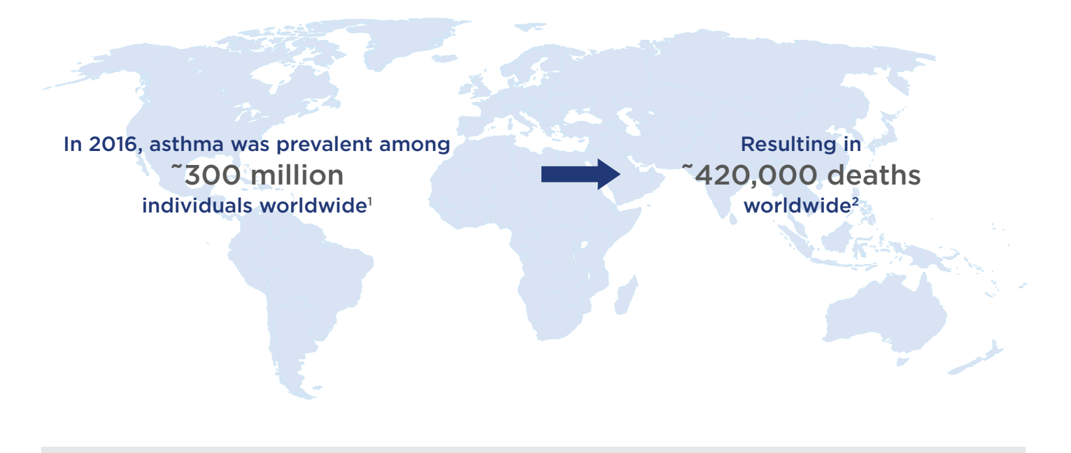
Figure 1: Asthma: A global public health concern.<sup>1,2</sup>

Similarly, Demoly et al.<sup>20</sup> found poorly controlled asthma was associated with a substantial use of healthcare resources and a negative overall impact on work productivity and daily life.