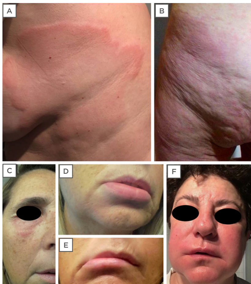
Figure 1: (A-B) Urticaria is characterised by an outbreak of swollen, pale red bumps or plaques on the skin (wheals). (C-F) Urticaria can also manifest as deep swelling around the eyes, lips, and face (angioedema) that appears suddenly.

At histological evaluation, wheals and angioedema present features common to inflammation including the vasodilatation of postcapillary venules, oedema, and a cellular infiltrate characterised by mast cell degranulation and migration of CD4+ T lymphocytes, monocytes, neutrophils, eosinophils, and basophils. 16 The oedema develops in the upper- and mid-dermis in the form of wheals, while angioedema involves the subcutaneous or submucosal tissue. 1 Cutaneous mast cells play a key role in CSU because their degranulation leads to the relapse of histamine; different proinflammatory cytokines, such as IL-1, IL-4, IL-5, IL-6, IL-8, and TNF- \alpha ; platelet-activation factor; vascular endothelial growth factor; matrix metalloproteinase-9; neuropeptides; and other vasoactive substances. 5 This is a standard inflammatory mechanism common to many inflammatory diseases. 1