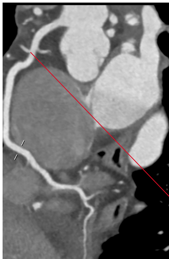
Healed and recanalised artery