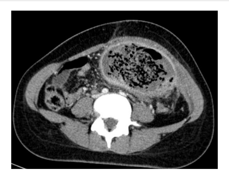
Figure 2: CT with intravenous contrast injection axial cut. Intraperitoneal heterogeneous hyperdense formation under the left hypochondrium with mixed component that did not enhance with intravenous contrast injection.