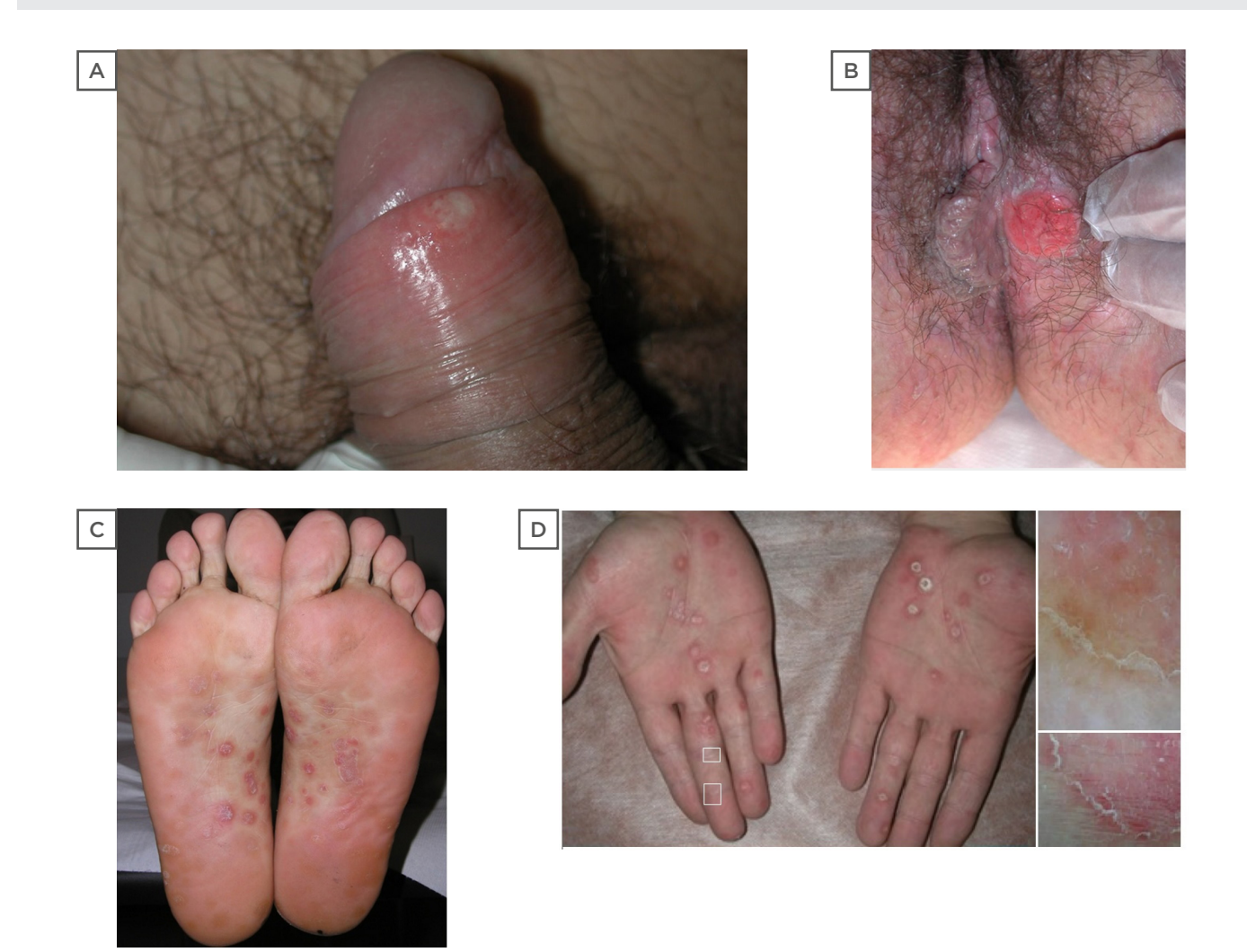
Figure 1: Clinical aspects of primary and secondary syphilis.

Two clinical presentations of the primary chancre, pathognomonic lesion of primary syphilis. A) Superficial erosion of the lesion at early stage on the glans in a 27-year-old male; B) advanced ulceration with raised indurated margins involving the perineal skin in a 34-year-old female. Secondary syphilis pathognomonic manifestations at palmoplantar sites consisting of erythematous papules with a central ring of scales (Biett's sign); C) soles of a 24-years-old male; D) and palms of a 45-year-old male. dermoscopic examination with contact polarised dermoscope (OM 17X) reveals an inward-oriented scaling collarette characterised by thick adherent white scales and erythermatous centre (D, squares).