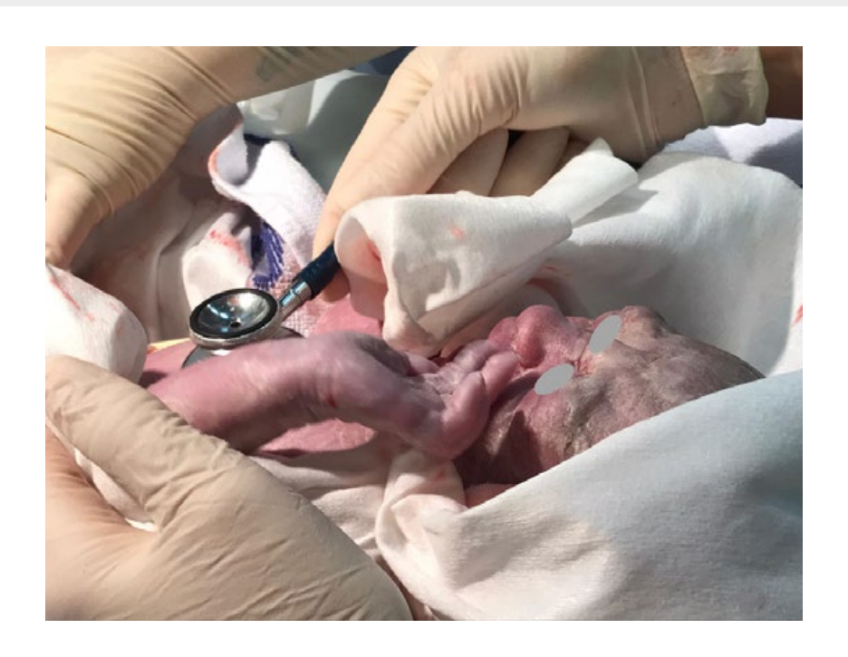
Figure 1: Vernix caseosa covering the skin of a newborn.

Caput succedaneum refers to a collection of oedematous fluid above the periosteum, between the outermost layer of the scalp and the subcutaneous tissue. It is a common lesion seen at birth, and results from the high pressure exerted on the infant's head by the vaginal walls and uterus as the head passes through the narrowed cervix during labour.8