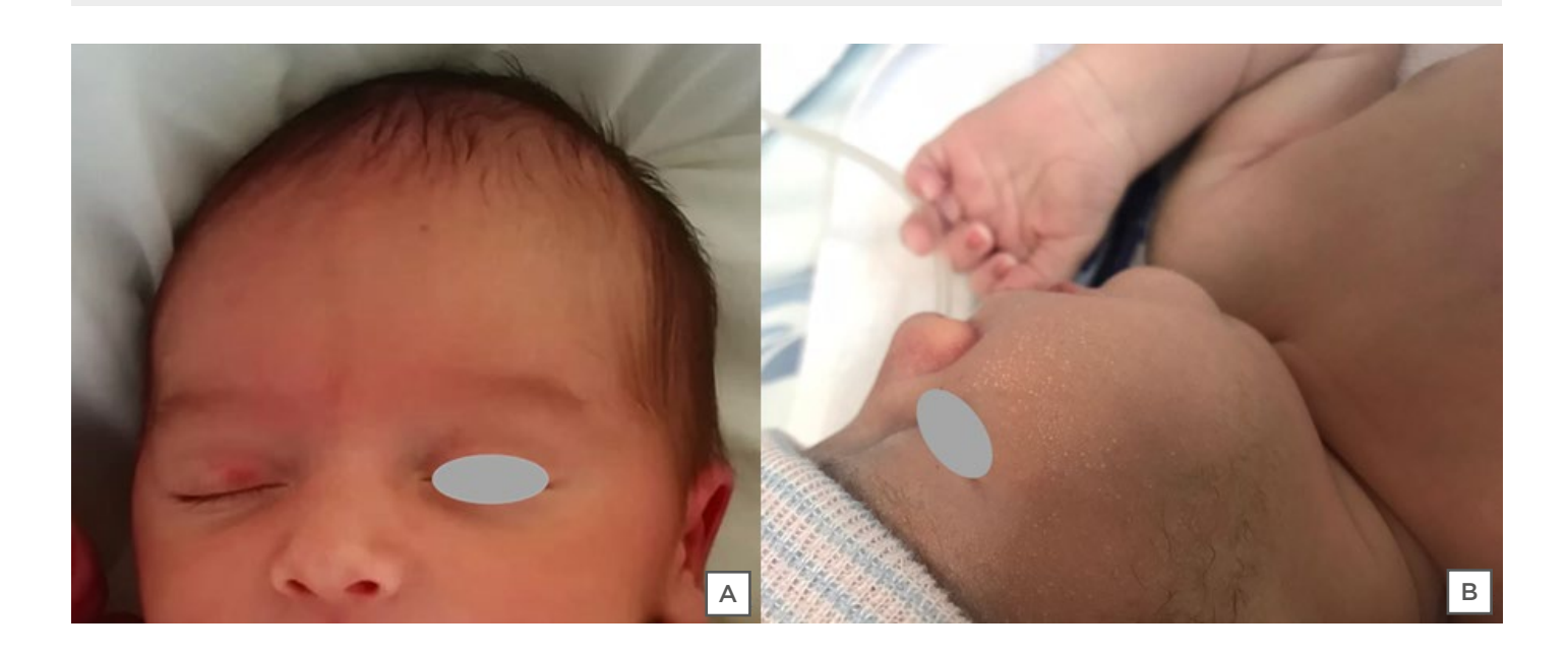
Figure 2: Physiological alterations. A) Salmon patch in the upper eyelid of a 1-week-old female. B) Milia cysts overlying the cheek of a 2-week-old newborn.

Onset at birth, disappearance with age, absence of mucosal involvement, and no progression to malignancy favour the diagnosis of MS.