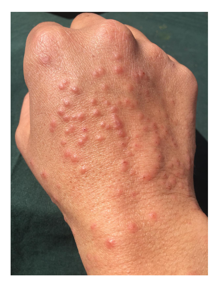
Figure 1: Large oedematous papules on the dorsum of the hand.