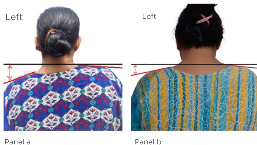
Figure 1: Appearance of patient at presentation and after treatment.

On presentation at the authors' hospital 10 months after the onset of symptoms, she appeared weak, anxious, and spoke in a low volume. She was breathless at rest and found it difficult to speak in complete sentences. Her left shoulder was drooping, with deltoid and supraspinatus muscles noticeably atrophied. There was no medial scapular winging that suggested that the long thoracic nerve was spared. The passive range of motion at the neck and shoulder joints was normal and not associated with the pain. Muscle strength on the left shoulder extension was 4/5, suggesting possible involvement of latissimus dorsi, teres major and posterior deltoid, and left shoulder abduction up to 90° was 3/5, indicating involvement of supraspinatus and deltoid muscles. Muscle strength on flexion and extension of the elbow and internal and external rotation of the left arm was 5/5. Muscle strength assessment on the right upper limb was normal. Touch, pain, and temperature sensation were normal in all the dermatomes, including the left C4-C5. The left biceps reflex was +1, and the brachioradialis and triceps reflexes were +2. Chest findings were significant for reduced air entry, vesicular breath sounds, and mild crepitations over the left lower lung zone. The rest of the physical examination was normal.