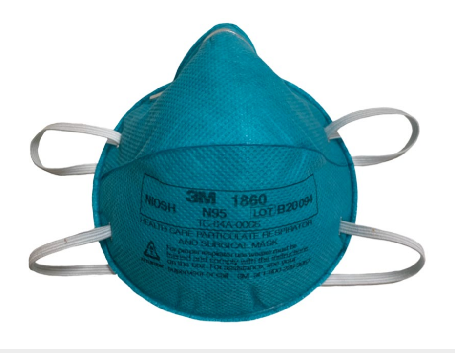
Figure 1: 3M<sup>™</sup> (Saint Paul, Minnesota, USA) Health Care Particulate Respirator and Surgical Mask 1860, N95 120 EA/ Case.

and related factors of COVID-19 infection in healthcare workers, it was found that 45 (29.80%) infected healthcare workers were male and 106 (70.20%) were female.<sup>19</sup> In European Union (EU) countries, a higher proportion of healthcare workers diagnosed with COVID-19 infection were female.<sup>20</sup>