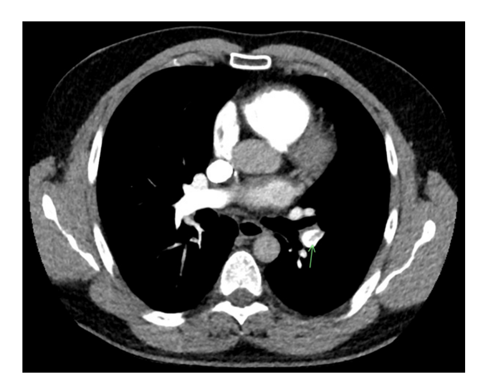
Figure 2: CT pulmonary angiography showing pulmonary embolism in the left lower segmental pulmonary artery.

Figure 1: MRI T2-weighted imaging showing a thrombus in the right internal jugular vein.