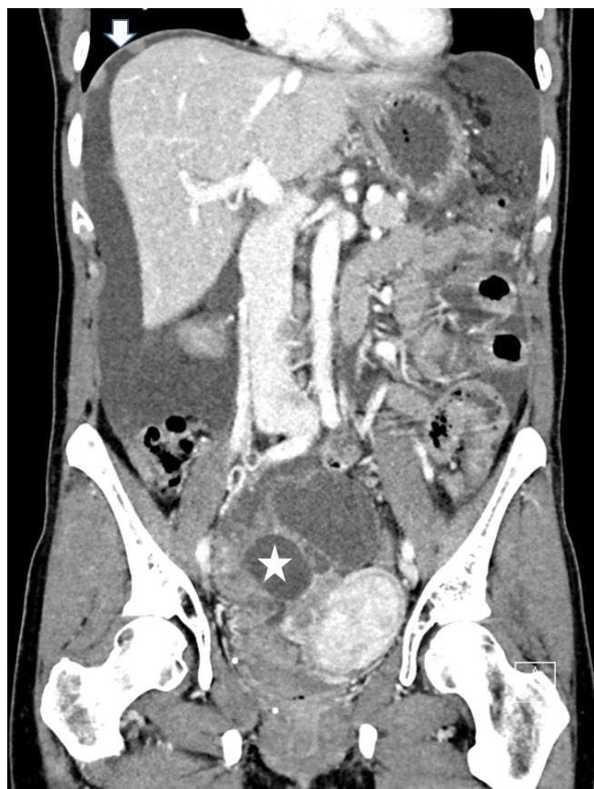
Figure 2: CT of advanced ovarian cancer.

Staging CT demonstrates a large solid and cystic pelvic mass (asterisk) adjacent to the uterus. Large amounts of ascites are seen, as well as peritoneal implants at the dome of the right diaphragm (arrow).