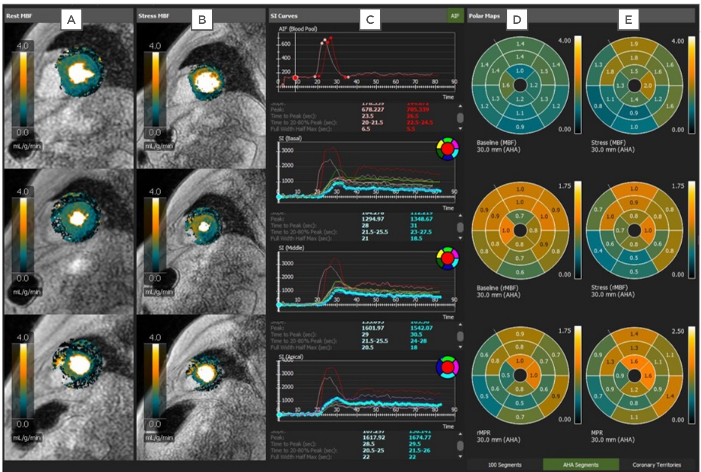
Figure 2: A perfusion quantitative assessment of stress cardiovascular magnetic resonance.

A and B Pixel maps demonstrating quantitative myocardial perfusion at rest ( A ) and after vasodilator stress ( B ). C Signal intensity curves. D and E Polar maps showing myocardial blood flow values at rest ( D ) and after vasodilator stress ( E ).