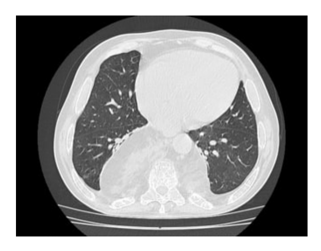
Figure 2: A chest CT scan, taken at 1-year follow-up from helical tomotherapy treatment, showing no progression in the size of the extramedullary haematopoiesis masses.

paravertebral EMH masses. After RT, the patient showed a rapid and remarkable reduction of dyspnoea. There was a progressive reduction in the size of the EMH masses, and at 1-year follow-up, the patient was totally asymptomatic with no side effects occurring. Therefore, it was concluded that RT may be an optimal and safe therapeutic approach in such cases.