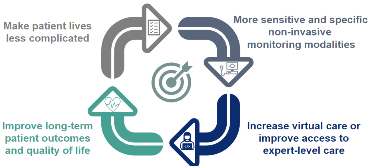
Figure 3: Ultimate goals for non-invasive monitoring.